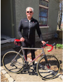
pic 8.jpg 270K