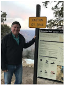
pic 10.jpg 43K