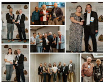
Annual Mtg Collage.jpg 434K