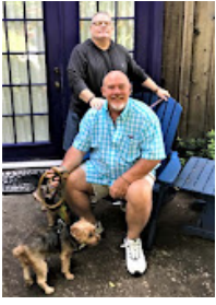
pic 9.jpg 56K